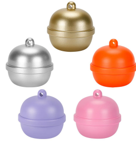
5 Colors Optional